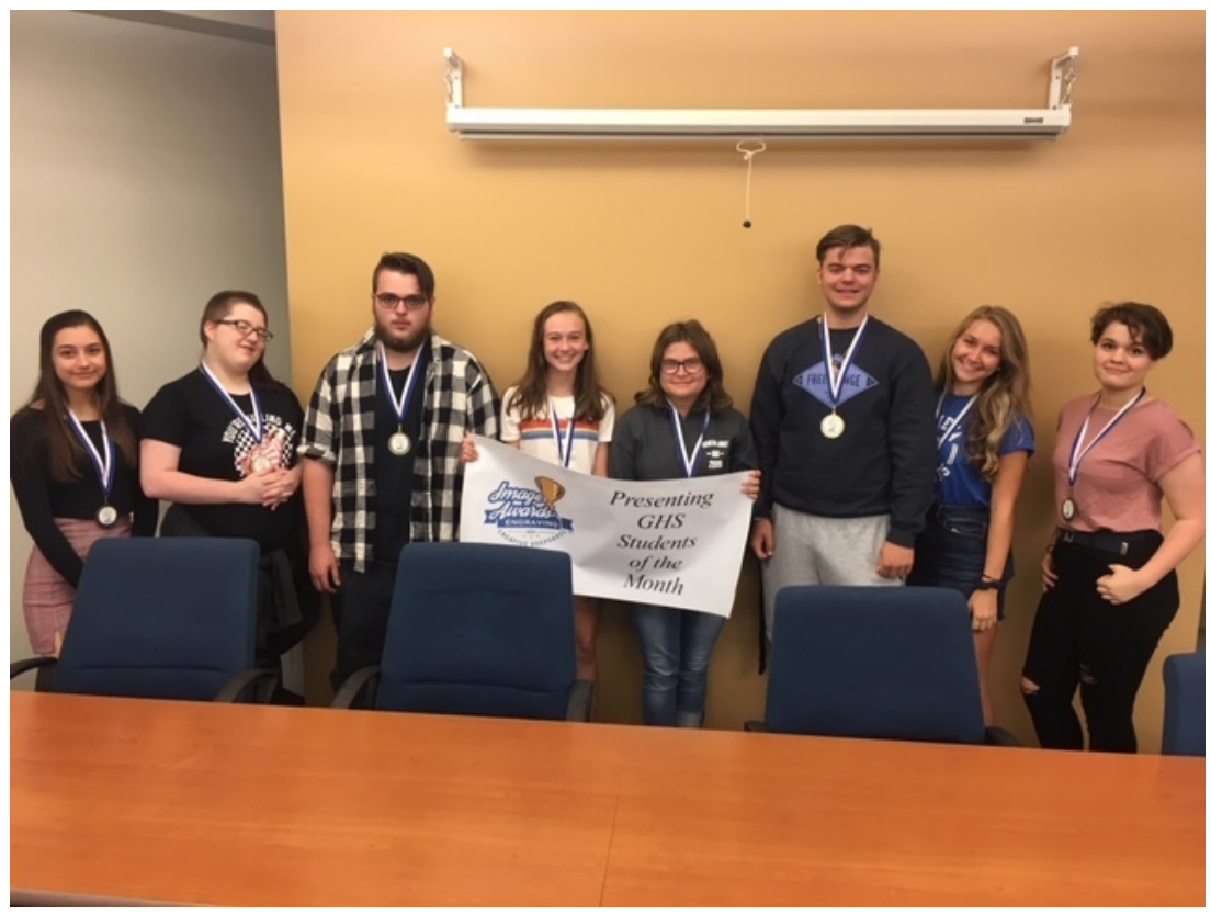
GHS Students of the Month: September

A GHS Student of the Month award is earned by a student who stands apart, succeeds despite circumstances, or contributes in some special way to our school.